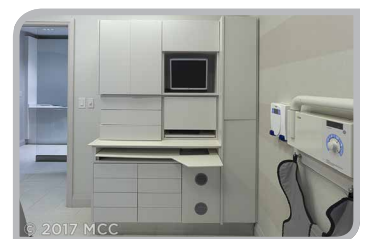
Kemp & Borovac Dentistry - Rear Cabinet.