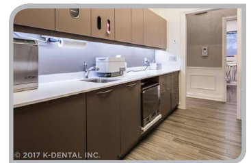
Clarington Dental Centre - Sterilization Center.