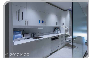
Kemp & Borovac Dentistry - ST Sterilization Center.