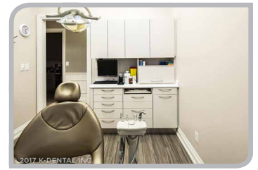
Clarington Dental Centre - Rear Cabinet.

Secondly, we try to develop the space plan with a concept in mind, and this concept becomes the driving force for the design of the interior. We are also always conscious of patient well-being, so our designs must reflect attention to the details that will help create a sense of trust, comfort, and tranquility.